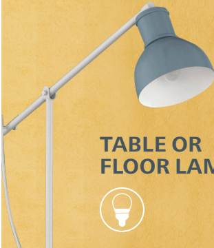
TABLE OR FLOOR LAMPS

Use this key to select the LED styles that are best suited for your home and fixtures.