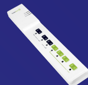
Advanced power strips