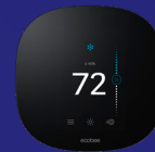
ENERGY STAR certified smart thermostats