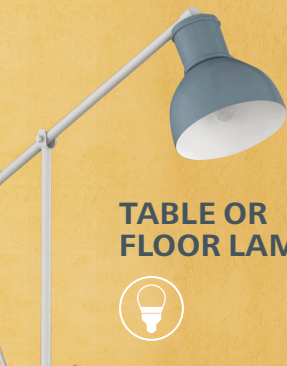
TABLE OR FLOOR LAMPS